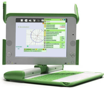
Etoys and DrGeo on an OLPC

Persistence management: object oriented databases (Magma, GemStone), relational databases (MySQL, PostgreSQL), object relational mapping (Glorp).